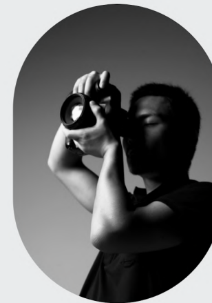
(POA) 4 WEEKS NOTICE PHOTOGRAPHER