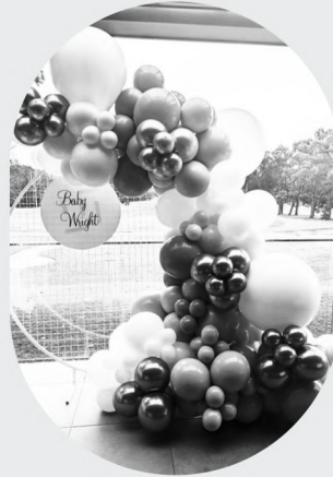
(POA) 3 WEEKS NOTICE BALLOONS & DECOR