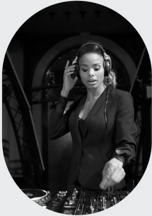
(POA) 3 WEEKS NOTICE DJ SERVICE