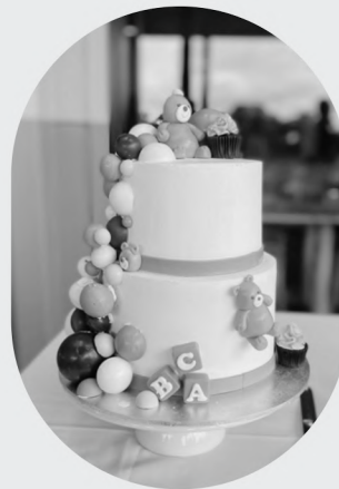
(POA) 3 WEEKS NOTICE CAKE SPECIALIST