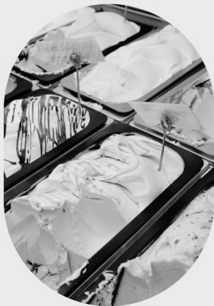
(POA) 4 WEEKS NOTICE GELATO CART