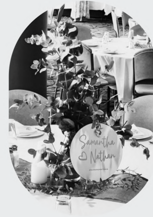
(POA) 3 WEEKS NOTICE FLORIST